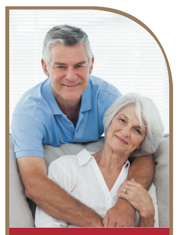
In This Issue

KEEPING YOUR FAMILY HEALTHY, WEALTHY & WISE